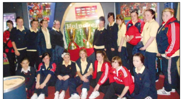
Transition years on their recent visit to Thomand Park