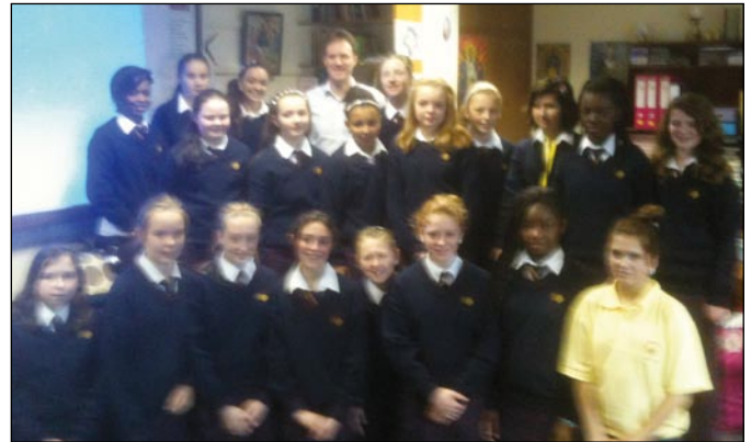
First Year Junior Achievement Programme