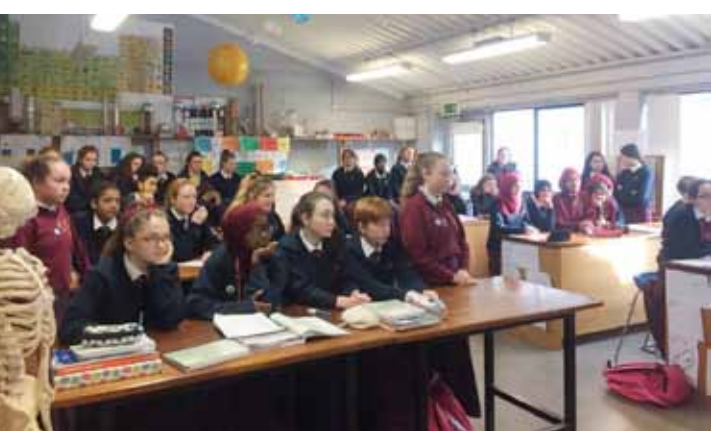
Science week 2017. Second and third years were treated to a science magic show.