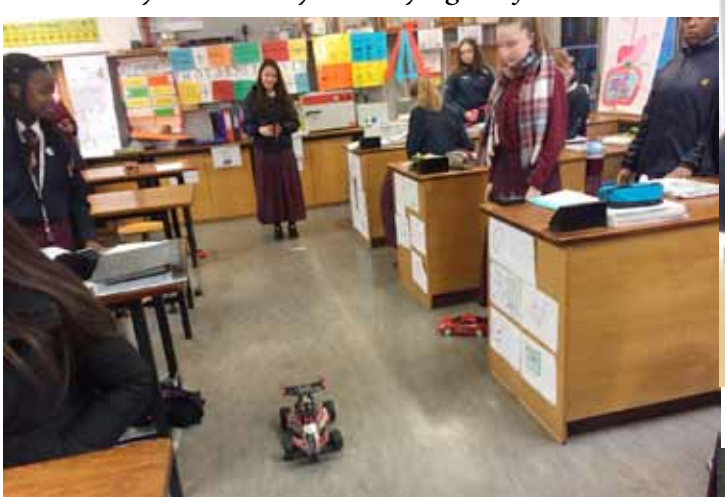
Third years calculating speed