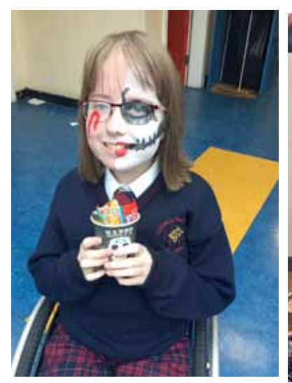
A happy customer from the event!