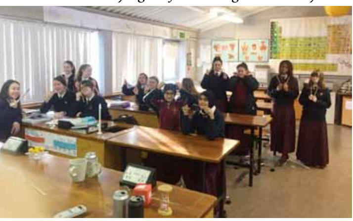
Science week 2017