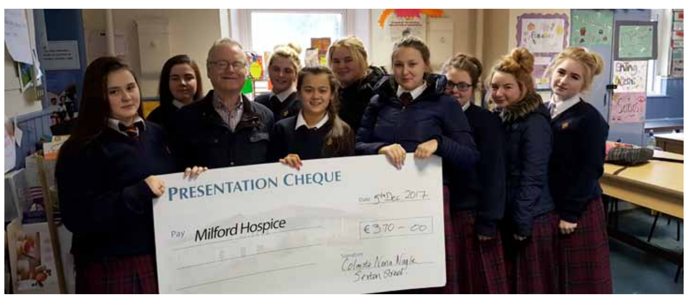
6LCA's presenting a cheque to Milford hospice for €370, raised by staff and students