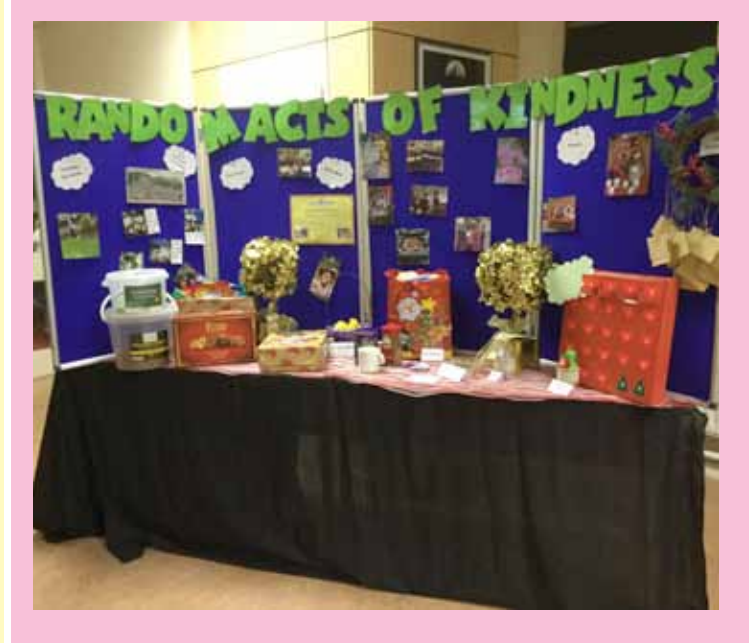
Some of the random acts of kindness the religious department were involved in collecting food for food hampers