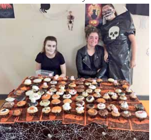
Look at all those cupcakes!!