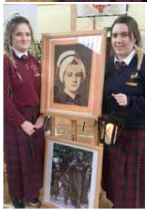
Beautiful images - Gems of Nano Nagle used during the ceremony