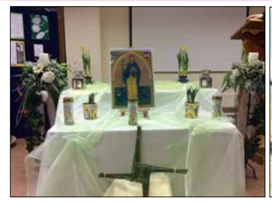
Sacred space for the feast of St. Bridget for Grandparents Celebrations