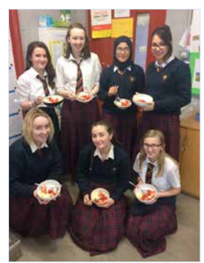
Fifth year ag science farmers having their home-grown strawberries and ice cream.

The future is TYs harvesting their potatoes, don't they have lovely 'eyes'. safe in the hands of our science department