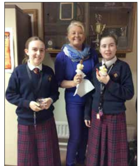
Selling ice-cream for our fundraising for Lourdes pilgrimage