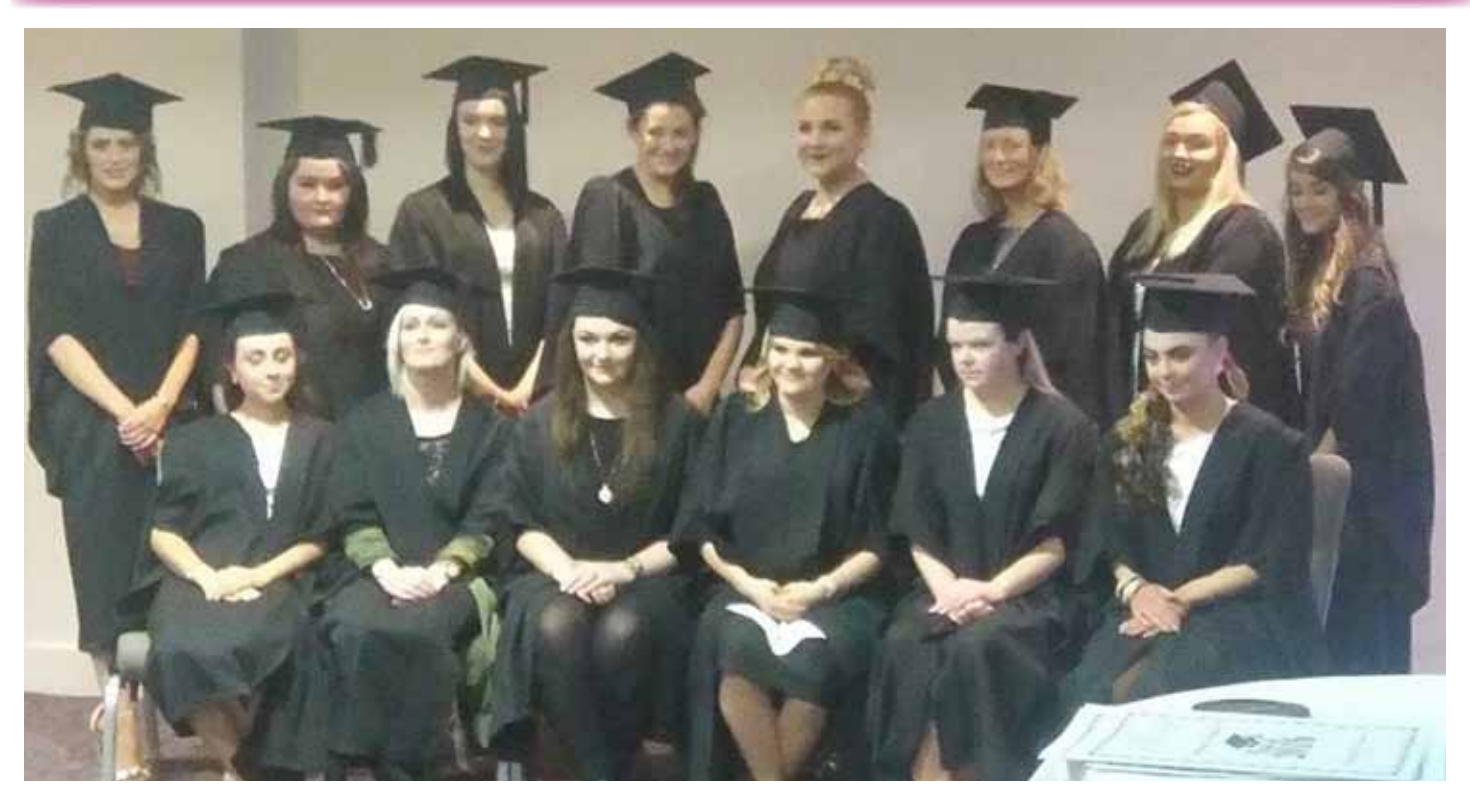
Childcare care level 5 Graduation - Strand Hotel, Limerick )Many have advanced to study Level 6 at CCL