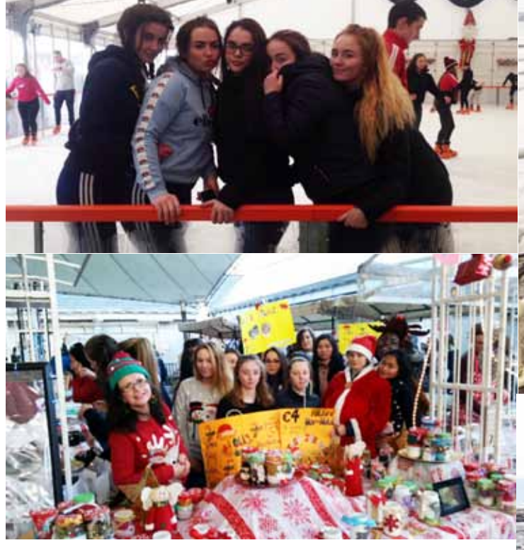
Photographic Exhibition Tuesday 20th December