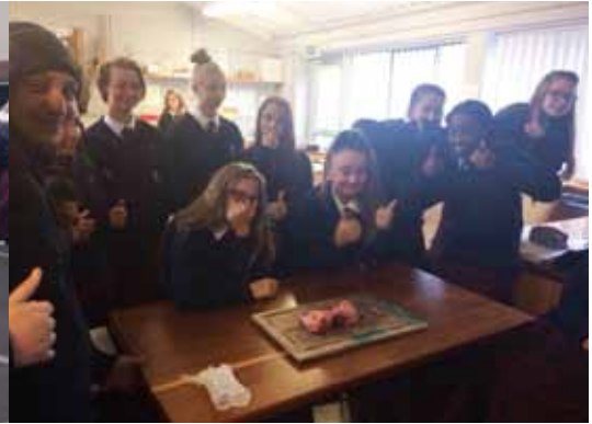
Second years dissecting the heart.