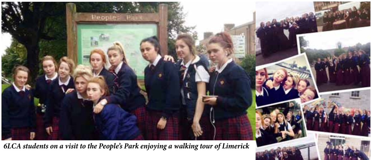
6LCA students on a visit to the People's Park enjoying a walking tour of Limerick

Congratulations to all third years who got great results in their Junior Certificate on September 15th.