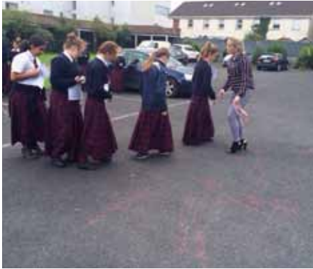
Second years acting out blood flow through the heart.