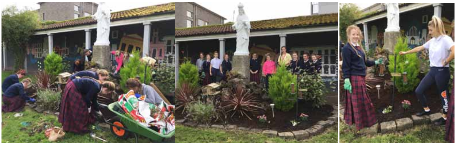
6LCA students cleaning, weeding and planting beside our Christ the King statue

Educational progression for our recent leaving certificate students has been excellent, with 84% of all graduates, both traditional and LCA, progressing onto some form of further education and training. 38% of the traditional leaving cert group have been offered 3rd level courses, predominately in LIT and UL. The main areas of study being social studies, humanities, business, economics and science. Huge congratulations to each student on their fantastic results and every best wish for the future