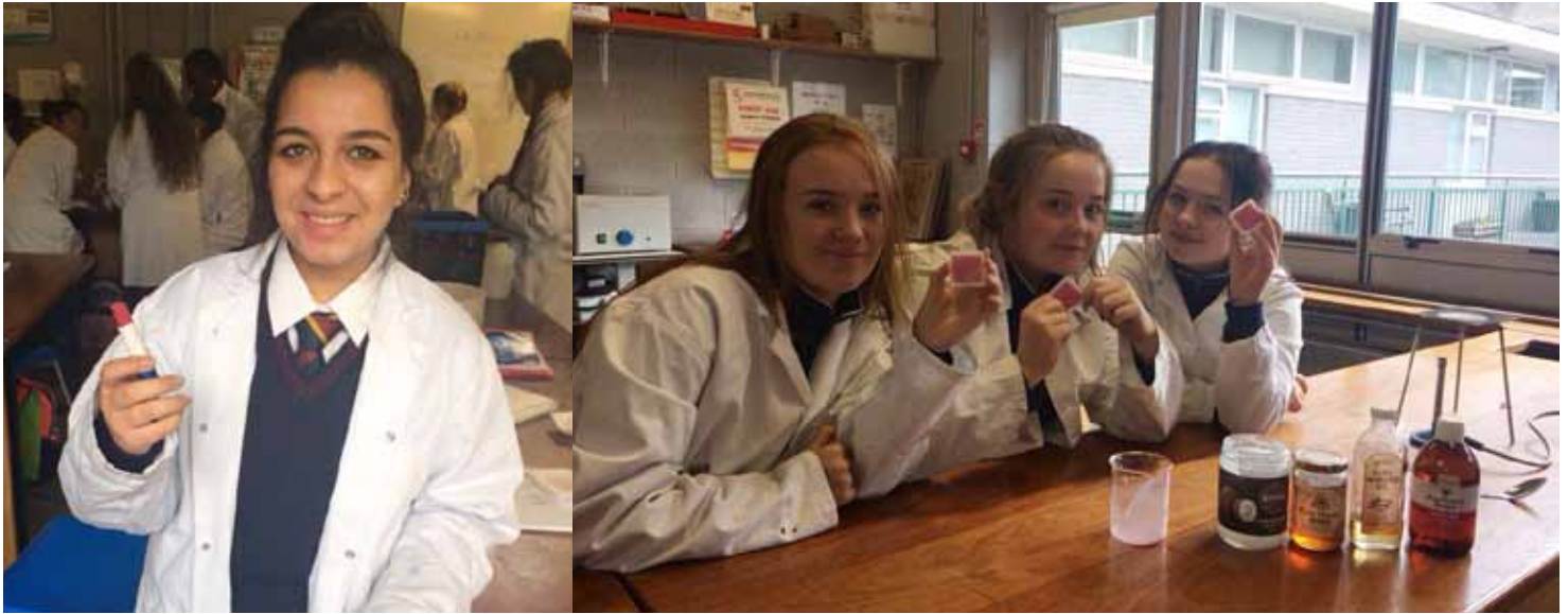
Transition year students making lip gloss and lip stick! Because they're worth it.