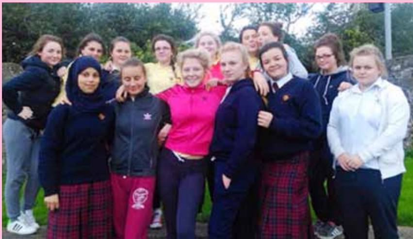
5LCAs getting active in PE